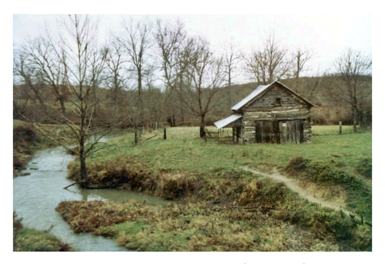
Keeney Cabin