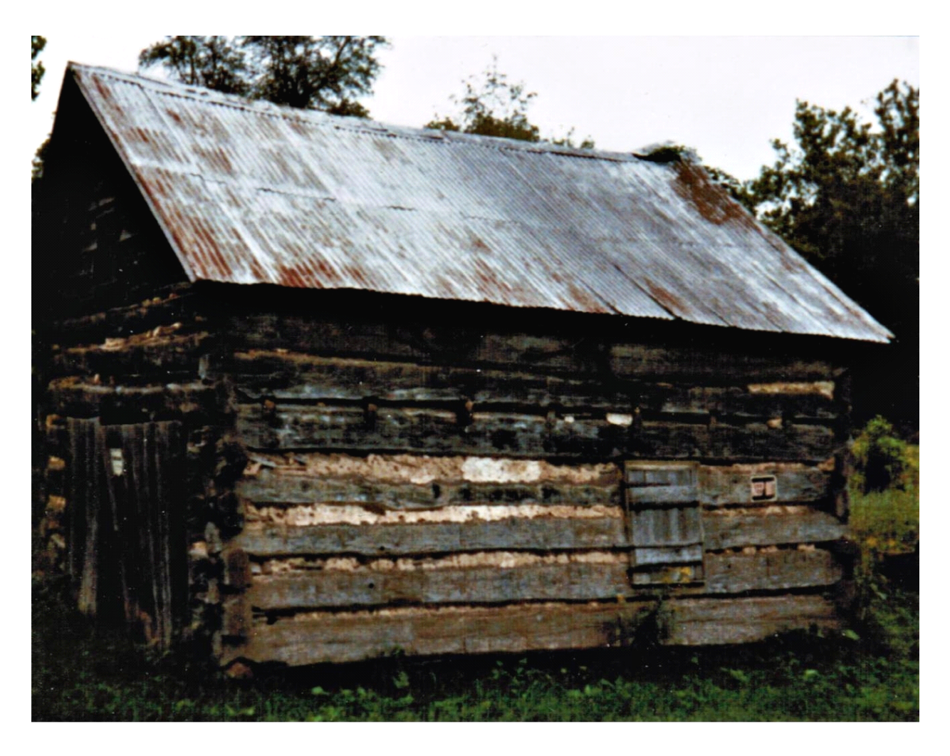
Keeney Cabin 1989 or 1990