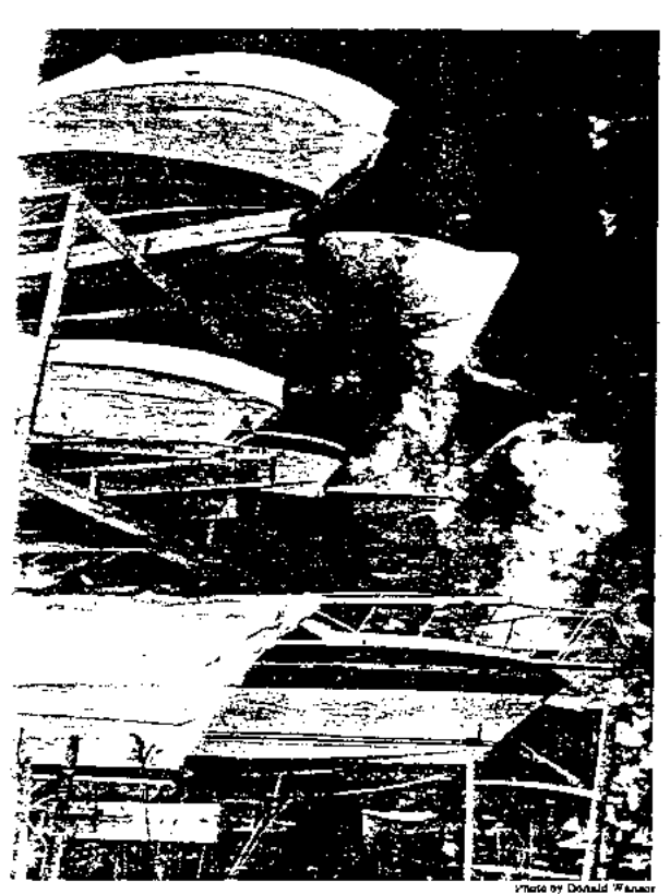
Stacked boats ablaze at height of Long Beach Manneland storage-yard fire

Witness: J.H. Turner, J.C. Leasure Filed: 22 January 1884 (J.P. Busbee) Clerk