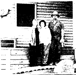
HENDRICKS COUNTY< INDIANA