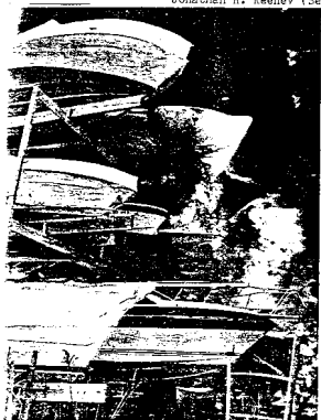
Stacked boats ablaze at height of Long Beach Manneland storage-yard fire