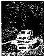
Greater photo by F. BRUCE PEACOCK

The tunnel allows residents of Seng Creek Hollow, quicker