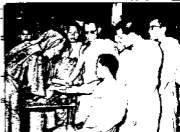
Ministering to Thai monks in N.E. Thailand in 1968