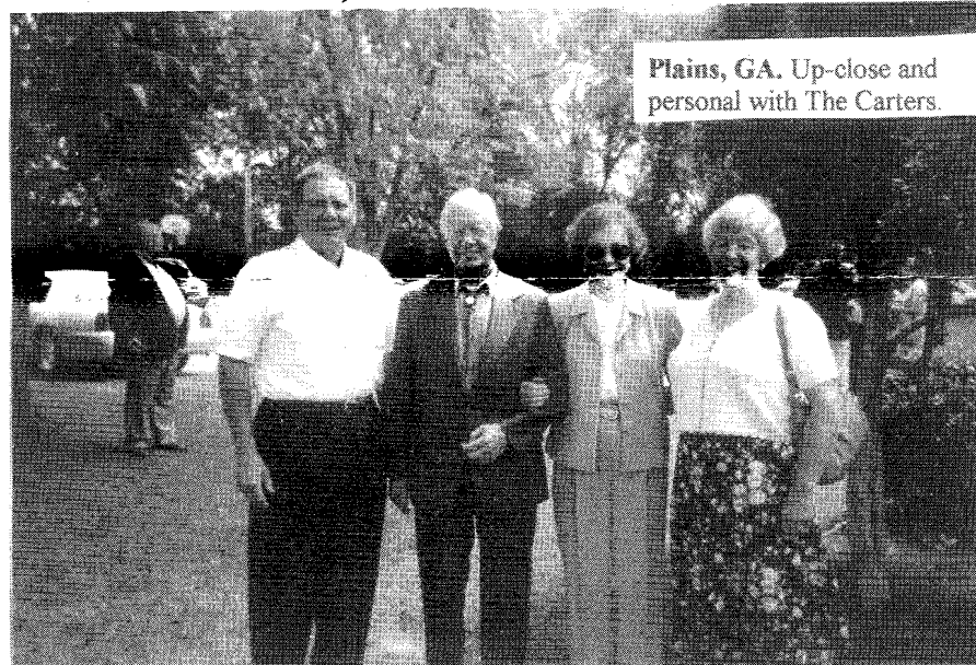
Plains, GA. Up-close and personal with The Carters.