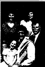
KEOKUK, IOWA KEENEYS