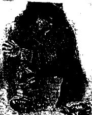
Craig Keeney (front), 14, and Jeremy Oda, 15, make creative use of their time away from school by building a 6-foot ig-