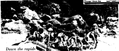
Down the rapids

The gorge offers its major rapids like Lower Keeney, shown here. Rafter's brace themselves and dig the paddle blades deep to keep from capsizing. The trips attract more than 80,000 rafters from around the country every summer.