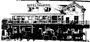
Central Oregon Stages made a regular stop at Hotel Shaniko to pick up passengers.