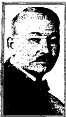
ROBERT HENRI. Eminent American Artist, Who Died Yesterday After Long Illness.

Subsequently Mr. Henri opened a school in Paris, at which he urged